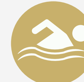
SWIMMING POOL WITH KIDS POOL