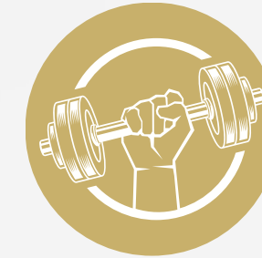
INDOOR & OUTDOOR GYM