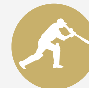
CRICKET PRACTICE PITCH