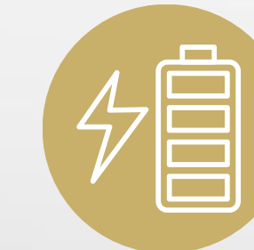
24/7 POWER BACKUP