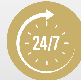
24/7 SECURITY WITH CCTV