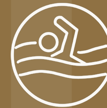
Swimming pool with kids pool