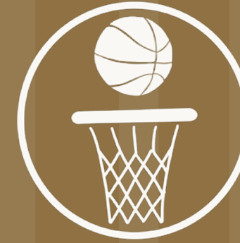
Basket Ball Area

Indulge in a world of convenience at Bilva. Elevate your living experience with amenities designed to meet your every needs, ensuring a perfect balance of style and comfort. Making every moment at home a true pleasure.