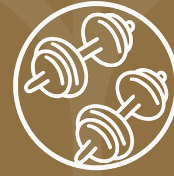
Indoor & Outdoor Gym