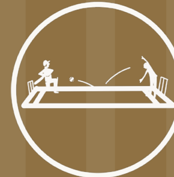
Cricket Practice Pitch