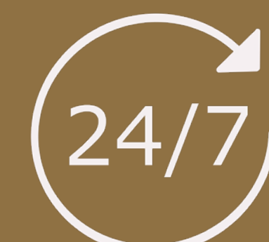
24/7 Security with CCTV