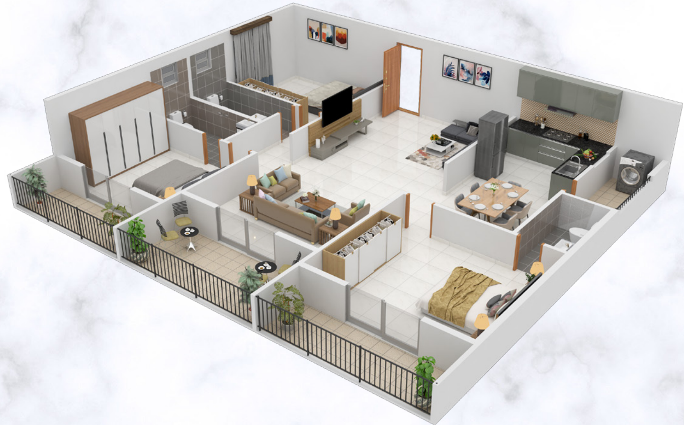
FLOOR PLAN ISOMETRIC VIEW