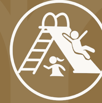
Children Play Area